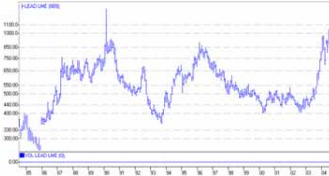
LME Price US$ / tonne