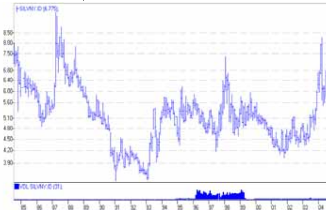
NY Price US$ / oz