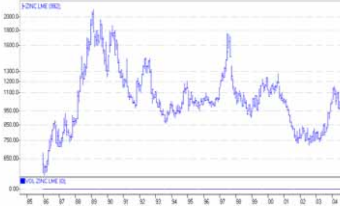
LME Price US$ / tonne